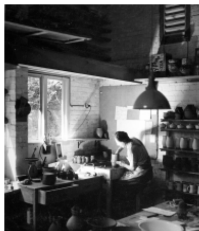
Bernard Leach at Dartington

The building is being given a much needed tidy up by Estate Services, but all of the original aspects are being preserved. We have even found the enamel lampshade that hung over Bernard's wheel and we are putting it back.