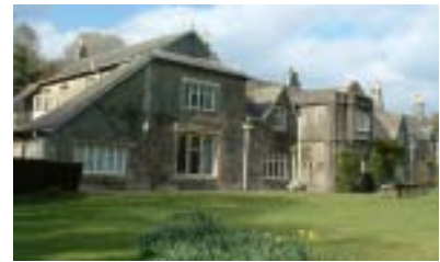
Schumacher College, Dartington