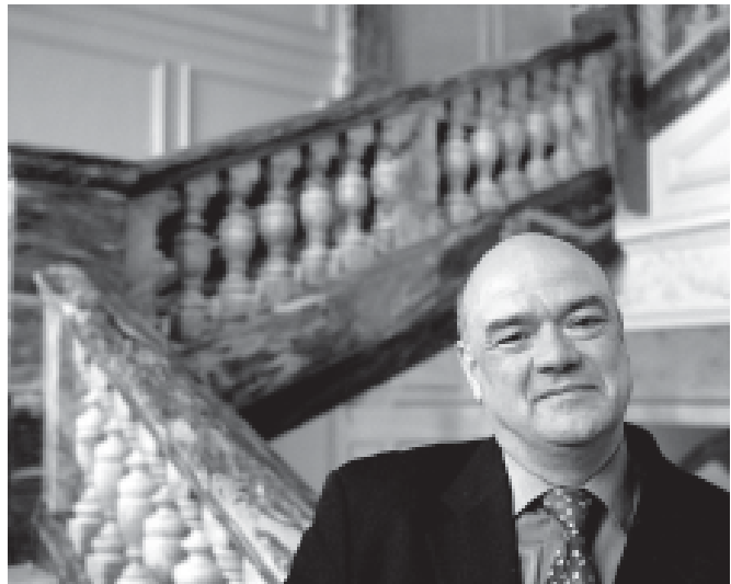
Nicholas Kenyon CBE

fantastic job over the last decade, bringing the Barbican to new heights. The Barbican is a unique and wonderful arts centre, looking better than ever after its refurbishment, and currently full of great events to celebrate its 25 th anniversary. Its partnership with the City of London brings creativity and excitement to the Square Mile and to London as a whole, highlighting the vital contribution of the arts to the life of a great city."