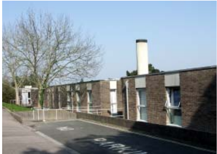
Higher Close, Dartington Hall