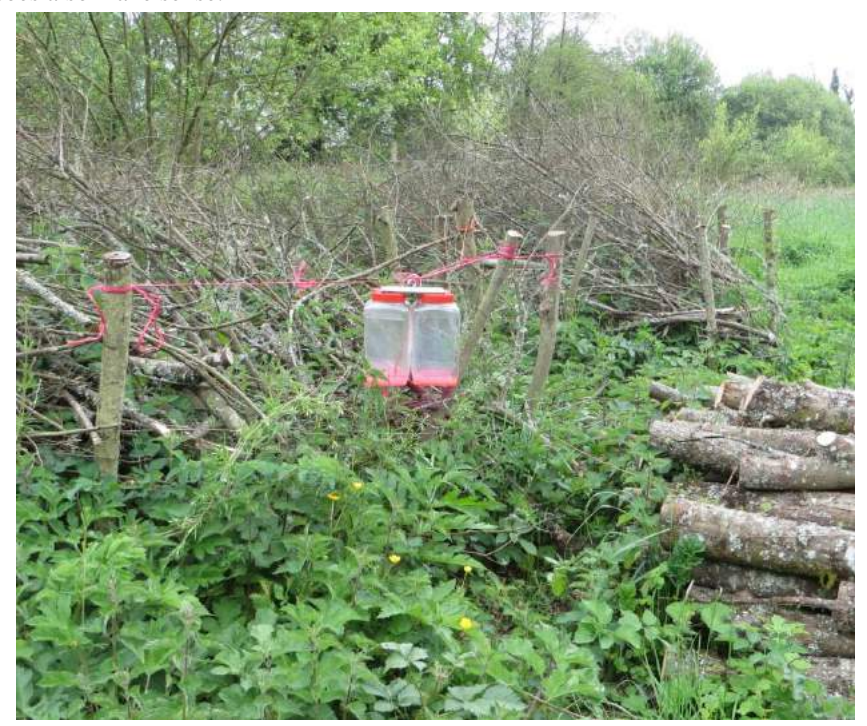
Fig. 1 Bottle trap in which M. lobatus specimens were caught, adjacent to a brash heap and near to a log pile; photograph taken on 16.v.2017.

A further question is: how does this small, flightless beetle occur in such abundance in traps designed to catch flying insects? By mid to late summer the vegetation around the traps had grown to their level, so specimens may have crawled or been blown off this; Fig. 1 shows that the herbage reached the bottom of the trap by May. If they do get carried around on the wind then capture by flight-trapping does also make sense.