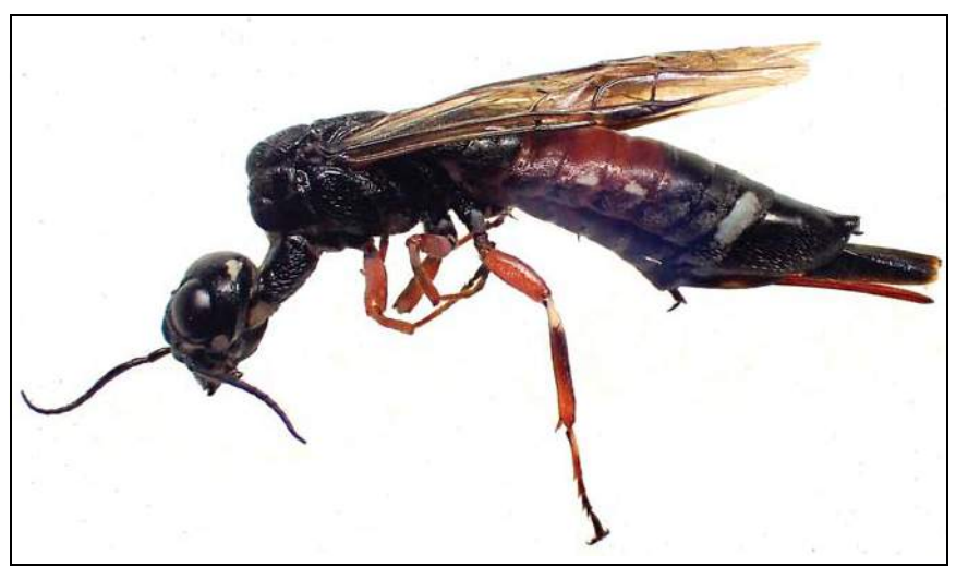
Fig. 1. Female Xiphydria prolongata lateral view, from Dartington Hall, Devon, 19th June 2018.

Willow Woodwasp Xiphydria prolongata (Geoffroy) (Hymenoptera: Xiphydriidae) found in South Devon. – Individual females of Xiphydria prolongata were found on 1st and 15th August 2017 in a flight interception trap over a pile of cut logs in an area of herb-rich damp grassland with willow and alder trees known as Berryman's Marsh (SX799615) adjacent to the River Dart on the Dartington Hall Estate, South Devon (VC 3). Full details of the locality and traps are given in Luff & Alexander (2017). The species seems to be established at the Devon site as a further female was caught on 19th June 2018. Xiphydria prolongata was readily recognised by the combination of ovipositor, long neck and red markings on the abdomen (Fig. 1).